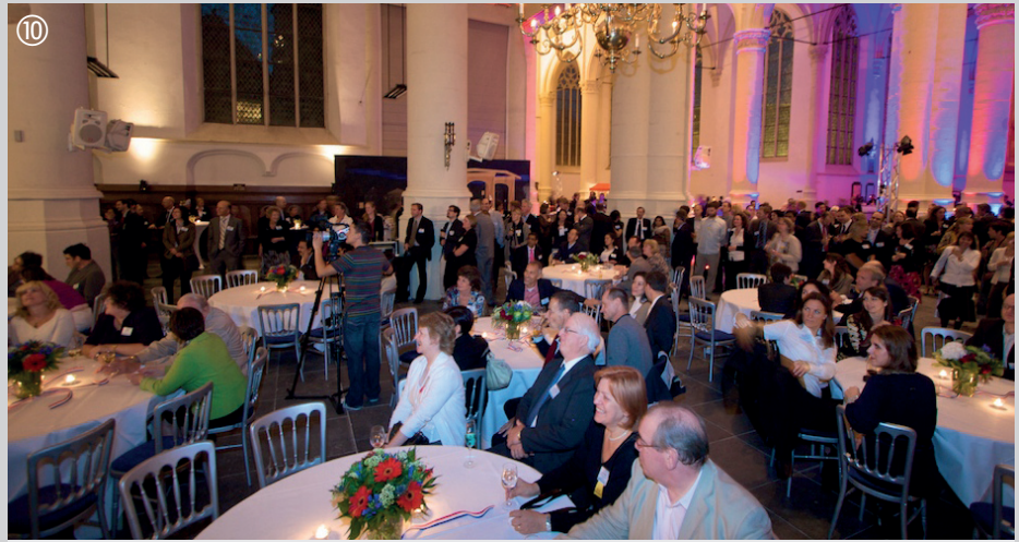
⑩ Wednesday evening's "Holland Past & Present" reception was held in the Hooglandse Kerk, in the town of Leiden, a former church that hosted traditional Dutch cultural demonstrations, food and music. ⑪ The entertainment included a gospel choir, pictured below.

MARQUES Position Paper: http://www.marques.org/Teams/TeamDownload.asp?FileID=71